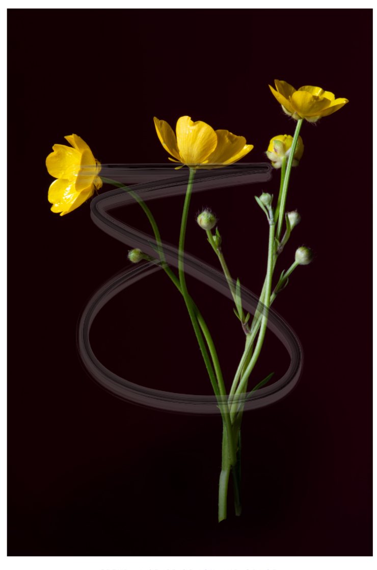
FREUD: A SENSE OF JOY AND GRACE BUTTERCUP FLOWERS, BUDS AND STEMS, SERIES, PAINTED - TALKING WITH ARTISTS/SENJAMIN DARLINGTON, LIMITED EDITION OF 20. COLLECTED: MAY 2023