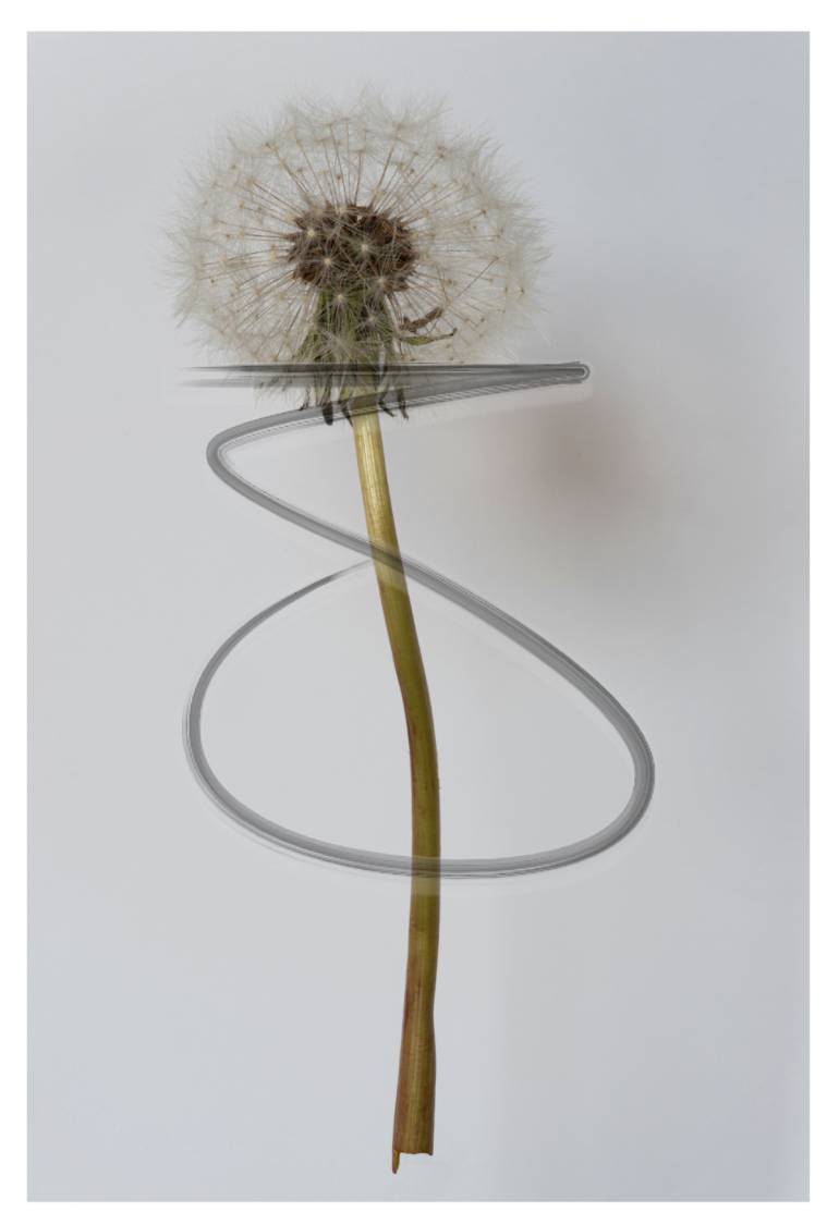
MILLAIS: BEING OPHELIA DANDELION SEED HEAD & STALK, SERIES: PAINTED - TAILLING WITH ARTISTS/BENJAMIN DARRINGTON, LIMITED EDITION OF 20. COLLECTED: MAY 2023