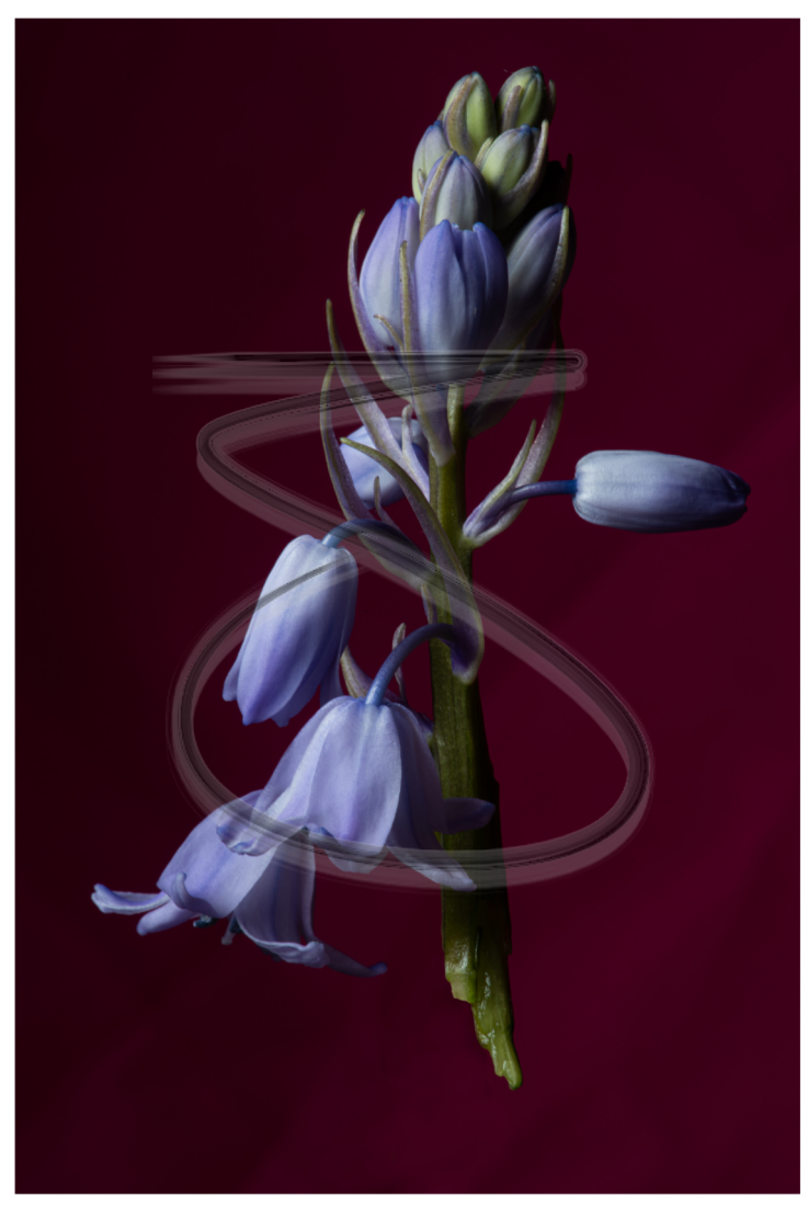
ROTHKO: DANCING WITH ANNE BRONTË BLUEBELL FLOWERS, BUDS AND STEM. SERIES: PAINTED - TALKING WITH ARTISTS/BENJAMIN DARLINGTON. LIMITED EDITION OF 20. COLLECTED: MAY 2023